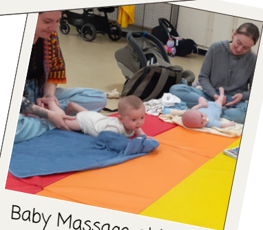
Baby Massage at Let's Talk Sessions