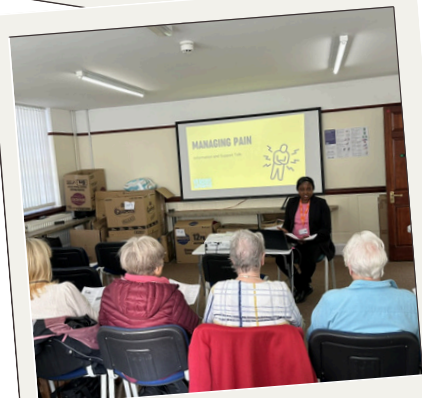
Pain Management Talk in partnership with Versus Arthritis