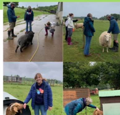
Volunteering Day at Dean Farm Trust

Wellbeing Links connects patients to local services before they require GP intervention, improving social connection and reducing primary care demand. In the last quarter, 125 requests resulted in 360 connections, with services praised by both GPs and patients. Creative and therapeutic activities support neurodivergent and isolated individuals, reinforcing prevention and early intervention goals.