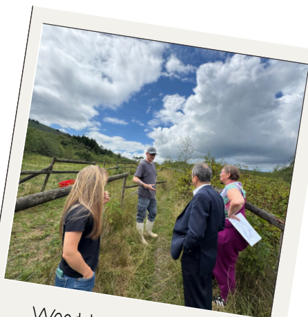
Woodchill CIC Site Visit

GAVO’s Participatory Budgeting (PB) programme has enabled communities to directly shape local funding priorities. Across Caerphilly, projects in Upper Rhymney Valley, the Van, Risca, and Greater Bargoed have engaged hundreds of residents, with grants allocated transparently to initiatives addressing mental health, youth engagement, and cost-of-living support. The PB programme continues to empower communities, fostering civic confidence and local ownership of decisions.